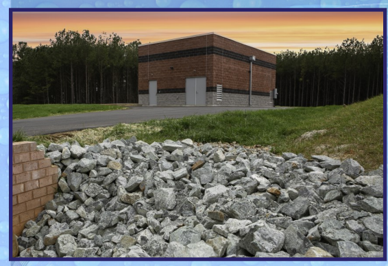
Hargrave Pump Station