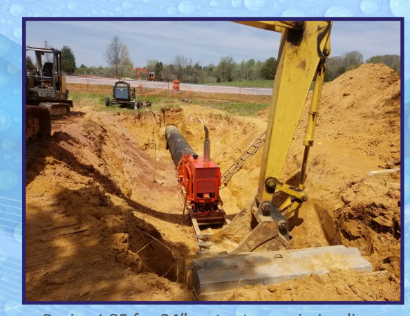
Boring I-85 for 24" water transmission line.