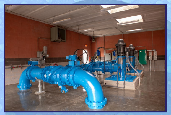
Hargrave Pump Station

On November 19, 2019, bids were taken to increase the capacity of the Old Highway 109 pump station in Thomasville. The existing pump station rated at 500,000 gallons per day was built in 1984. The new pump station will have three pumps and a generator with a firm capacity of 2.1 million gallons per day. Construction will begin early 2020. Water line construction will be needed to help transport additional water. Approximately 40,800 feet of water line will be added to support the new pump station. The estimated expense for this project and line construction is $6 million.